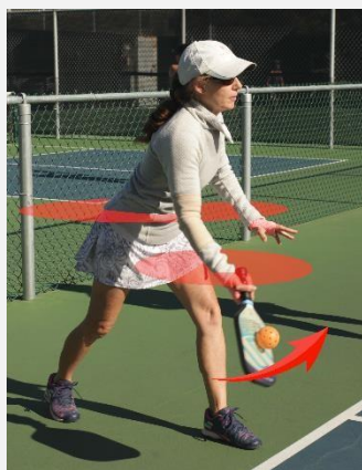
Figure 4-3 (legal serve)

(Photos and graphics courtesy of Steve Taylor, Digital Spatula)