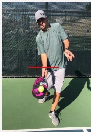
Figure 4-1 (legal serve)